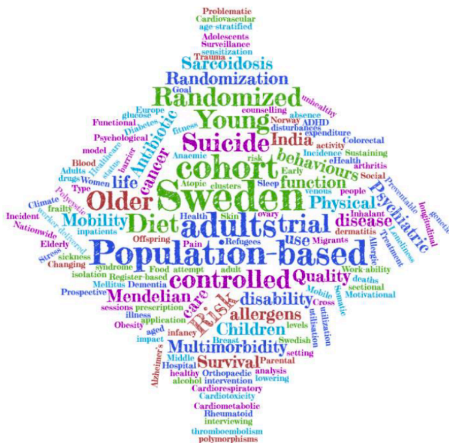
Figure: Thesis topics of MPH class of 2020.